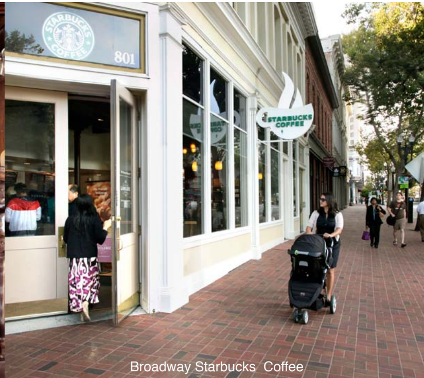
Broadway Starbucks Coffee

Old Oakland offers high-end professional office and retail space in a creative environment.